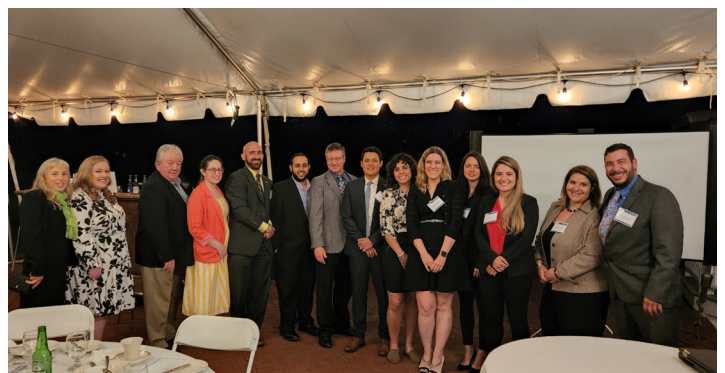
North Jersey Branch attendees