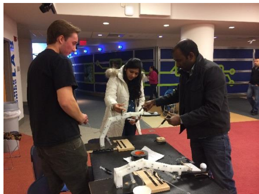
We make our activities exciting for guests of all ages!