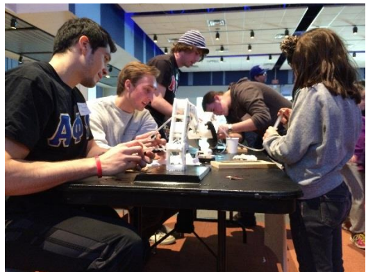
Volunteers from around the NY/NJ area help to make Engineers Week a success year after year.

Year after year, Engineers Week hosts up to 8,000 children and parents at the museum over two days of Engineers Week. They participated in educational programs, games, and contests created, sponsored, and executed by our organization with the assistance of 200 dedicated volunteers. This coming year, on Monday, February 19 and Saturday, February 24 , we will once again offer our attendees the unique opportunity to learn about the many ways in which engineering impacts and improves their lives. This event promises to be both educational and entertaining for all attendees.