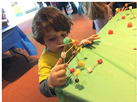
Hands-on activities give visitors the chance to try some engineering for themselves.

Engineers Week is an outreach event intended to raise awareness and appreciation for all types of engineering. With the help of our volunteers, we will incorporate past successful exhibits, activities, and contests, as well as include new ideas developed by our organization to challenge children and adults while promoting interest in engineering and science. Our activities focus on highlighting the excitement of engineering. More information can be found on our website at: www.ascenjb.org/eweek