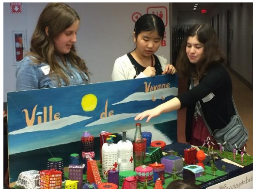
Volunteers range from middle school students to working professionals.